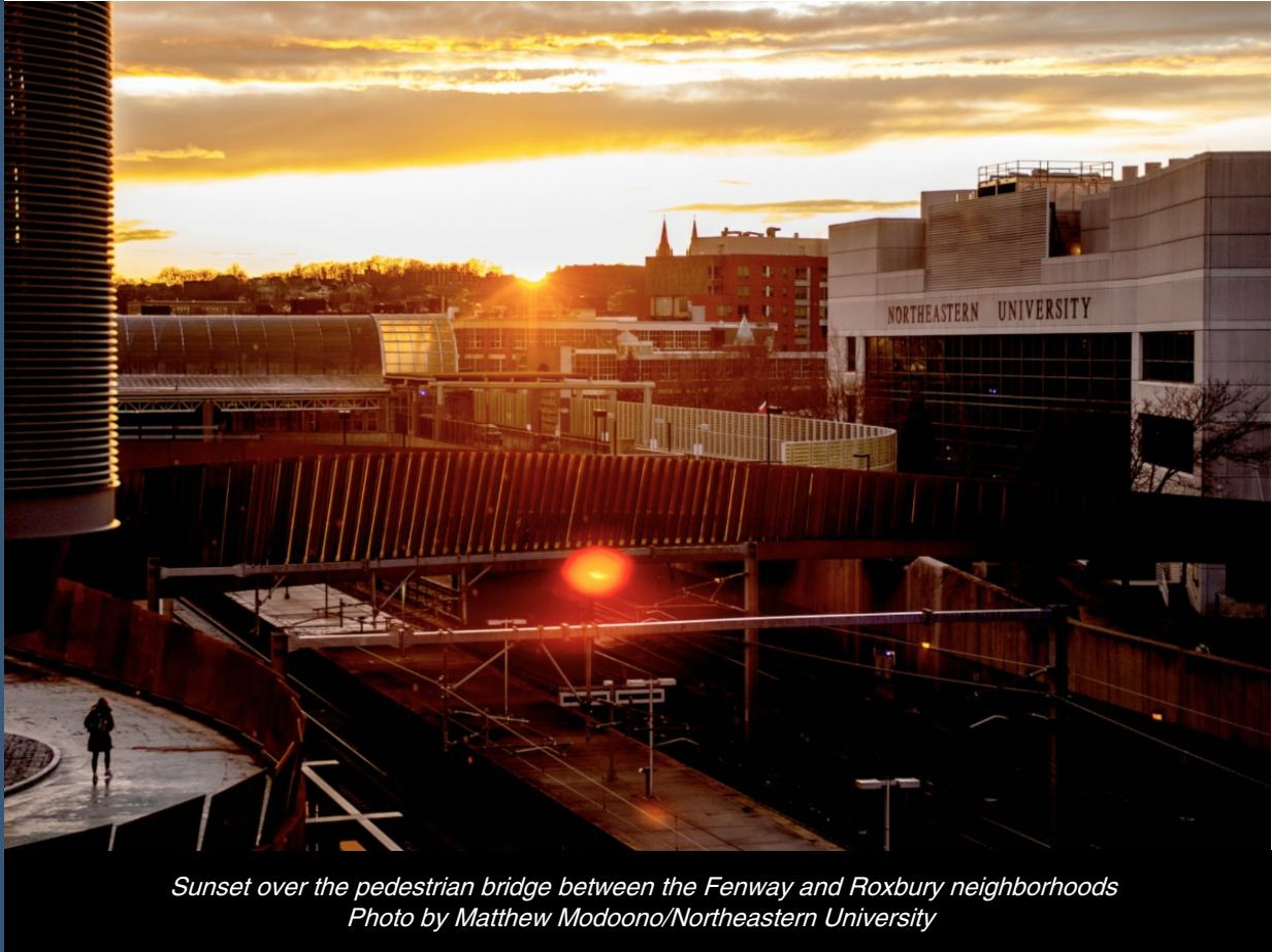
Sunset over the pedestrian bridge between the Fenway and Roxbury neighborhoods

Happy New Year to our community partners, students, residents, and faculty! As we continue navigating our current reality, the City and Community Engagement team remains committed to fostering collaborative relationships and partnerships that connect, educate, and engage our network while protecting our community's health. Explore the many ways Northeastern engages with our local communities in the newly released 2020 Community Benefits Annual Report!