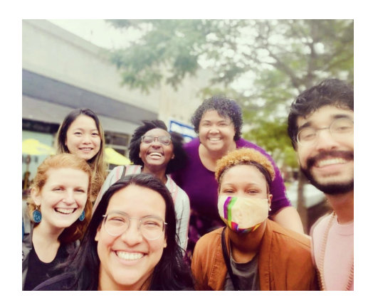
Watch MPF's Speaker of the Year Series at the links below!